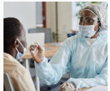
Graduate RNs and RPNs

Graduates who have completed an accredited Licensed Practical Nurse education program and are active or eligible for registration and practice permit with the College of Licensed Practical Nurses of Alberta (CLPNA).