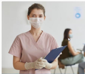
Graduate Licensed Practical Nurses

For students actively enrolled in an accredited nursing education program leading to initial entry to practice as a Registered Nurse or Registered Psychiatric Nurse. You must have completed a minimum of 450 hours of clinical practice in an accredited nursing education program.