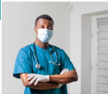
Undergraduate Nursing Employees

For students actively enrolled in an accredited nursing education program leading to initial entry to practice as a Registered Nurse or Registered Psychiatric Nurse. You must have completed a minimum of 450 hours of clinical practice in an accredited nursing education program.